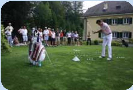
Golf clinic with special Credit Suisse guest PGA Player Paolo Quirici