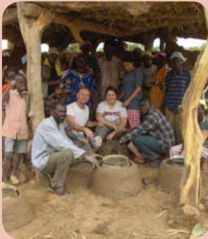
Burkina Faso, December 2008

During the academic year 2008-9 three service projects were run by the School. In December 2008 two staff and seven students went to Burkina Faso where they were involved with the refurbishment of a school near Ouahigouya. They also assisted with making improved fireplaces to increase fuel efficiency and to reduce illnesses associated with smoke inhalation. The group also visited the Dogon community in nearby Mali.