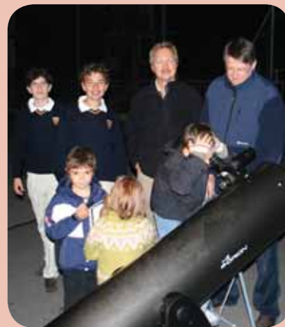
Aiglon staff and students introducing local school children to the wonders of the night sky

For more information about the UNESCO/IAU organised International Year of Astronomy in your country visit www.astronomy2009.org