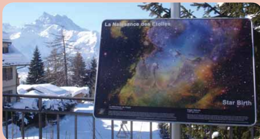
'From Earth to the Universe' - one of the boards from our public exhibition in the avenue centrale in Villars