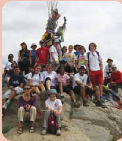
Ladakh, July 2009

During Easter 2009 three staff took a group of twenty students to Wardha to help in the construction of a community centre at an ashram that was once a home to Gandhi, the "father" of Indian independence. The group also visited the Golden Triangle and the Taj Mahal.