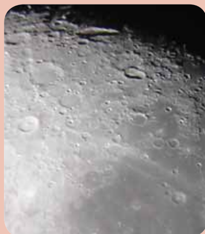
'Moon - Mare Humorum and the craters Tycho and Gassendi' taken through the School's 30" Dobsonian reflector