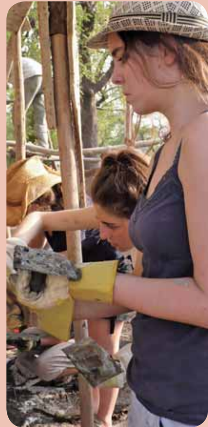
Wardha, India, March 2009

Service always has been, and always will be, an important part of the Aiglon education.